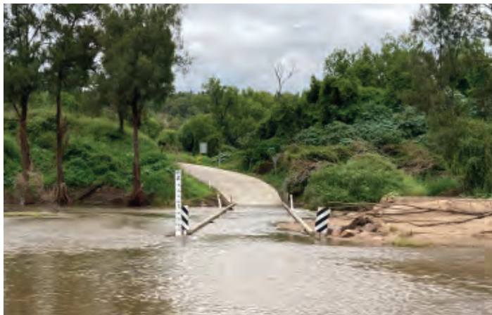
Above: Lemington Road / Moses Crossing in flood

During consultation, some residents expressed concerns about increased travel time from Jerrys Plains to the New England Highway. Our traffic impact assessment shows increased travel time of around 2 minutes. By preventing flooding, the new bridge will actually reduce travel times that residents currently experience during wet weather.