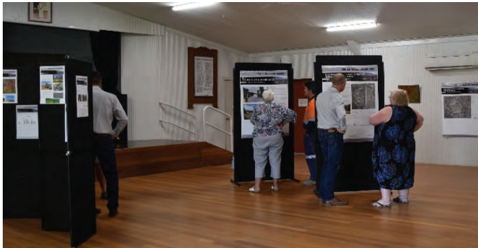
Above: Jerrys Plains Community Information Session

We appreciate the feedback and look forward to ongoing discussions throughout this process.